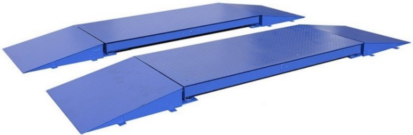
Portable Weighbridge with ramps